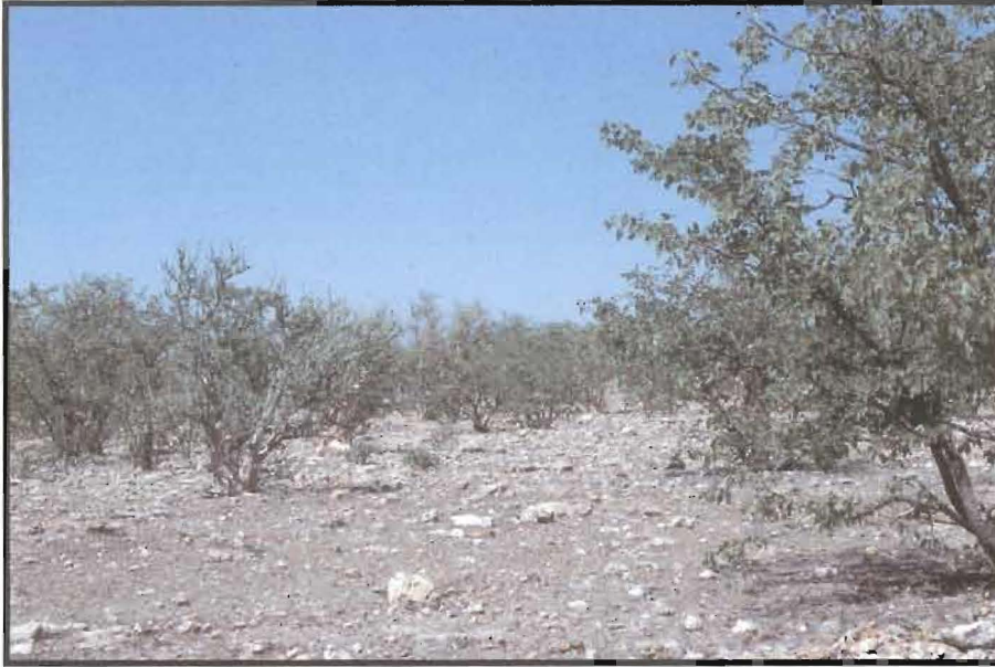
Figure 5 Shallow, calcareous soils in Namibian Mopaneveld.