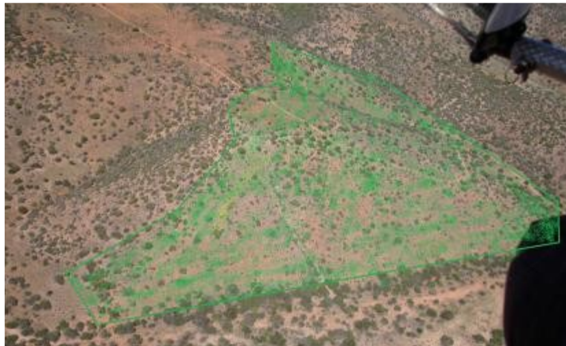
Figure 1: Proposed restoration plot on plateau south of Gannaland. The upper part appears degraded but is a restoring thicket wide plot

The plateau south of Gannaland is degraded and situated southwest of the Farmstead of Zandvlakte (figure 2). The area was not only selected for the easy access, but as well for the vulnerability to erosion and loss of water infiltration capacity of this area. The bordering part (figure 3) is a thicket wide plot and is restoring.