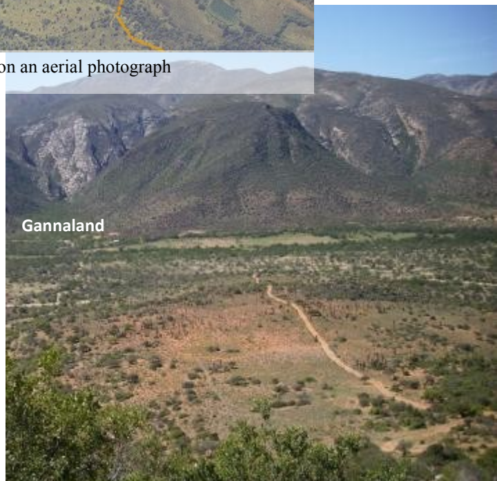
Figure 3: View on the current thicket wide plot which will be continued. Small spekboom cuttings are doing well in this area

The proposed plot size is 14 hectares and will be a continuation of one of the Thicket Wide plots. Stock farming is not present in this area, so free roaming live stock shouldn't pose a threat to the planted trees. Planting spekboom in this area will reduce direct water runoff and erosion to the Baviaanskloof river. The area will be monitored to able to quantify the benefits of this restoration effort (carbon, water, erosion). This progress will be done in close collaboration with the landowner.